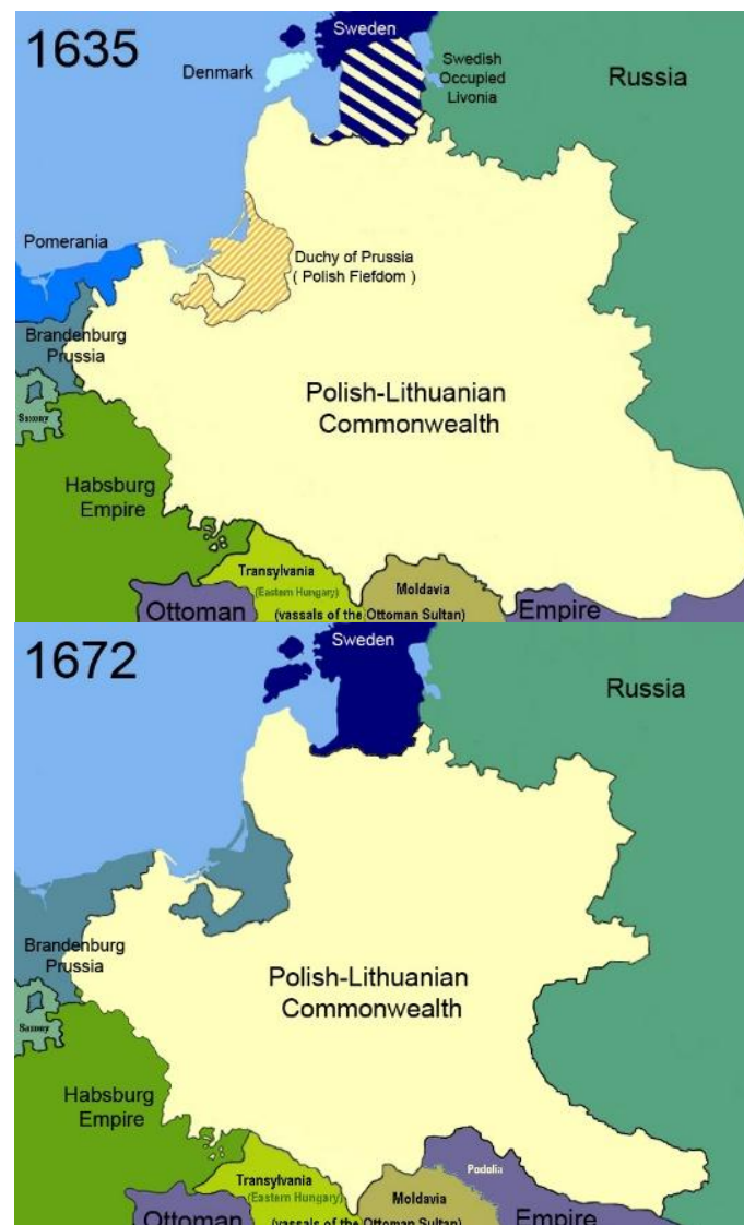
Fig. S1. The Polish–Lithuanian Commonwealth in 1635 and 1672 (source: Wikimedia Commons – Polish–Lithuanian Commonwealth in 1635 ( https://upload.wikimedia.org/wikipedia/commons/0/06/Polish-Lithuanian_Commonwealth_1635.png ) and Wikimedia Commons – Polish–Lithuanian Commonwealth in 1672 ( https://upload.wikimedia.org/wikipedia/commons/0/06/Polish-Lithuanian_Commonwealth_in_1672.png ).

Corresponding authors: Andrzej Arażny, andy@umk.pl & Rajmund Przybylak, rp11@umk.pl