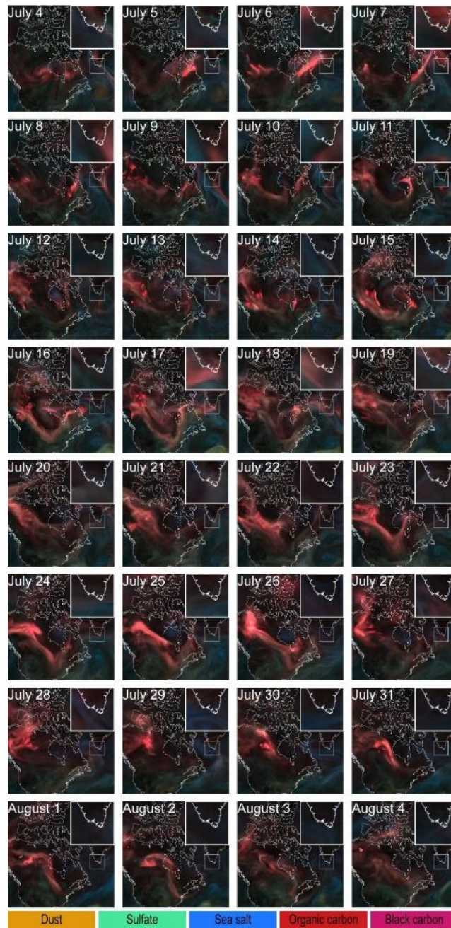
Figure S1. Spatial distributions of various aerosol types modelled by an aerosol model over Canada, USA, and 15 Greenland during the sampling period. The box in the top right corner of each panel shows an enlarged model product over southern Greenland. The aerosol model products were developed by Meteorological Research Institute and Kyushu University and was supplied by the P-Tree System of the Japan Aerospace Exploration Agency (JAXA) ( https://www.eorc.jaxa.jp/ptree/aerosol_model/index.htm )