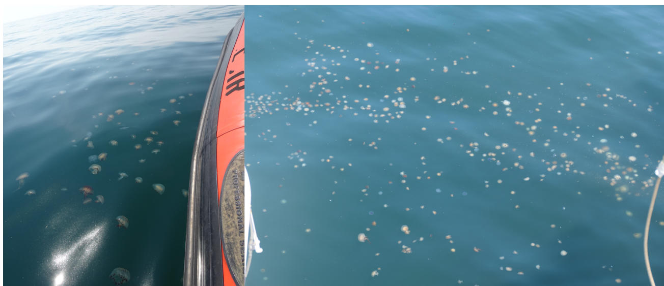
Figure S2: In-situ environmental conditions with organisms such as jellyfish on 21 July 2024.