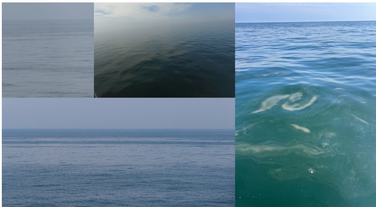
Figure S1: Calm sea surface state with a smooth sea surface due to suppressed capillary waves on 21 July 2024.