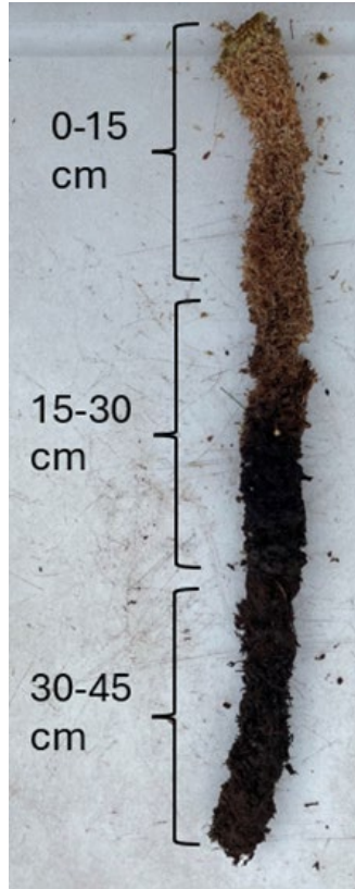
Figure S2. Soil core from the permafrost plateau showing the three depth intervals (shallow, intermediate, and deep) used for sectioning each core.