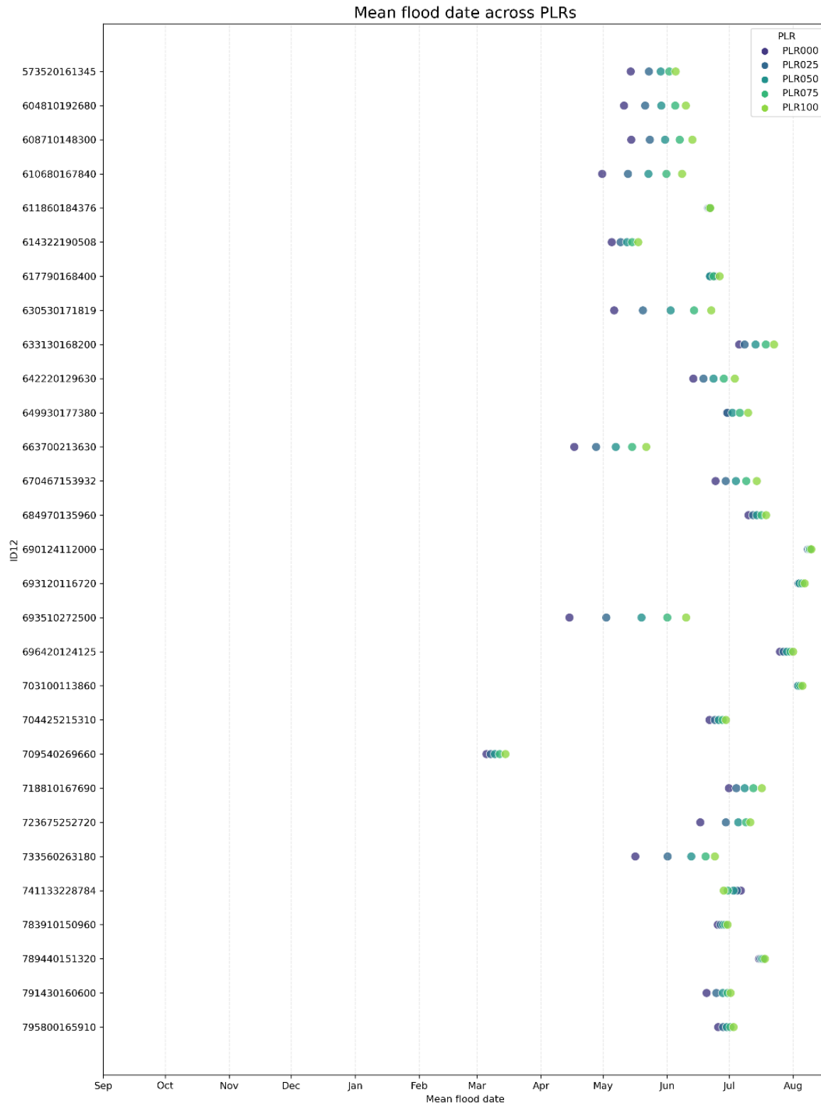
Figure S1 Mean monthly date of flood occurrence for all catchments and PLRs