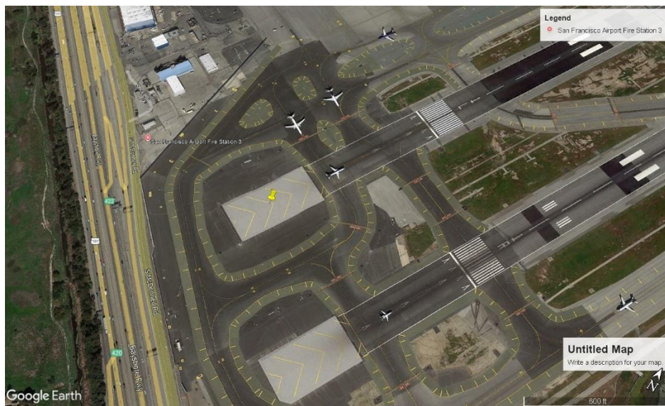
Runway 1L end – Year 2015