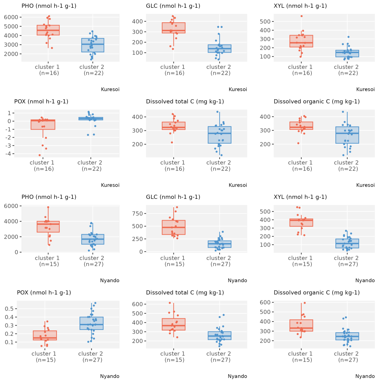
Figure 5: Box and whisker plots of selected transient variables that show a significant mean difference ( p < 0.05 ) between two clusters in both Kuresoi and Nyando, with observations (coloured dots) overlaid on top.