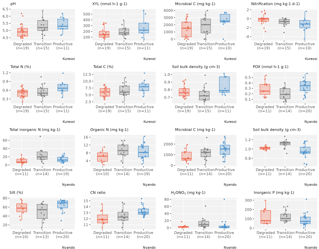
Figure 3: Boxplots of the soil variables with significant difference between degradation classes based on ANOVA or Kruskal-Wallis test from Kuresoi and Nyando respectively. The coloured dots are the observations overlaid on top of the boxplots.

Thank you for your advice! We produced a new graph with new labels to match the variable names in the summary table, and colours to represent different degradation classes.