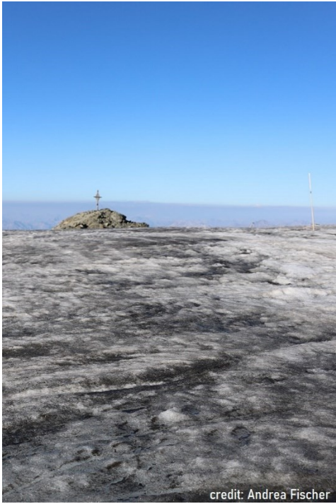
Figure S2: Photo of the summit region of the WSS summit glacier. The uniformly appearing dust layer due to ablation indicates the homogeneous common depth horizon across the summit region.