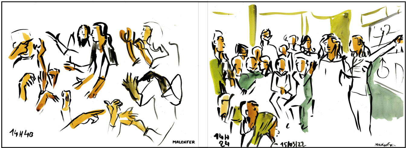
Figure 6: Painting realized during a workshop in a hearing-impaired children's classroom by the live sketching artist, Frederic Malenfer. The artist illustrated the collective work of deciding and inventing sign-language gestures for “air pollution sensor”.