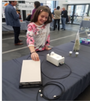
Figure 4: Child performing measurements of bark samples in Component 3 with a susceptibility meter. Image reproduced with permission from the child's legal guardians.

Depending on the type of event, the first three components of the workshop were complemented by a lecture given by a 225 researcher, a debate, and/or a proposition to draw solutions or observations (Table 1).