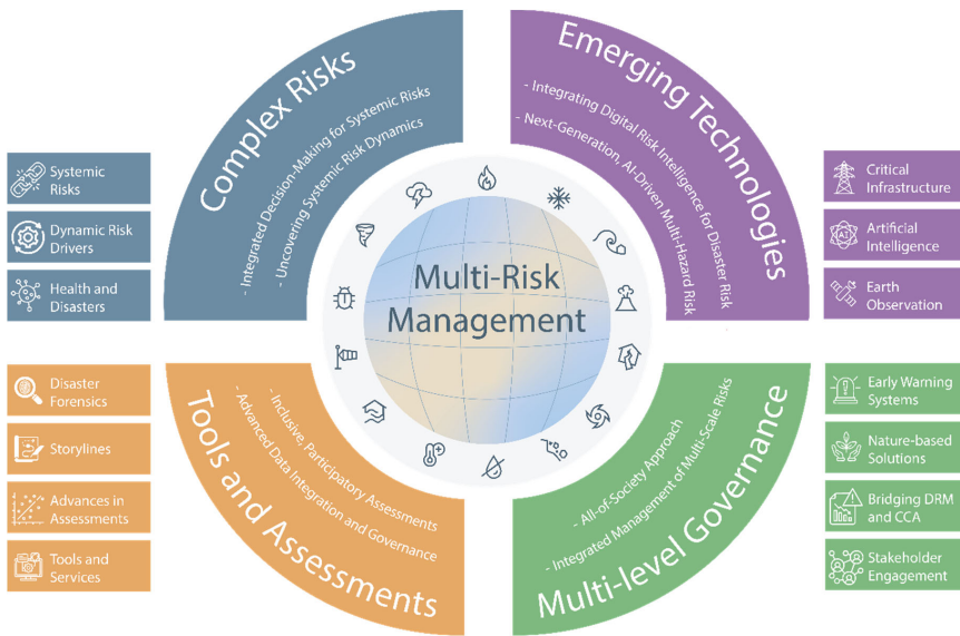
Figure 1: Overview of the four perspective themes and key messages (circle segments) and the contributing conference session topics (smaller rectangles at the sides).