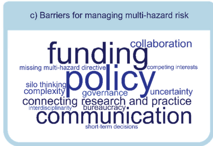
Figure 2: Word clouds depicting survey responses on multi-hazard risk research priorities and barriers. Survey respondents (n=86) identified key themes for (a) future progress in multi-hazard research, emphasising the need for better models, data integration, and artificial intelligence applications; barriers to (b) understanding multi-hazard risks, highlighting funding constraints, data limitations, and interdisciplinary communication challenges; and barriers to (c) managing multi-hazard risks, focusing on policy gaps, funding issues, and communication between research and practice. Word size reflects frequency of mention across open-ended survey responses.

Our analysis of survey responses validates three key dimensions of the barriers and priorities identified in Section 4.1. Firstly, respondents emphasised that effective risk management for multi-hazards requires institutions that are both capable of and committed to making long-term, large-scale investments in knowledge generation and sharing , policy development, and concrete actions across domains and geographies. These efforts should both inform and be informed by relevant physical and social science research as interpreted, integrated, or indeed enhanced by qualified boundary-spanning organisations as part of an all-of-society approach. This directly supports our recommendation to invest in boundary organisations and knowledge brokers (Table 2).