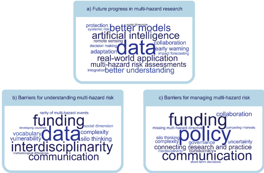
1545 Figure 2: Word clouds depicting survey responses on multi-hazard risk research priorities and barriers. Survey respondents (n=86) identified key themes for (a) future progress in multi-hazard research, emphasising the need for better models, data integration, and artificial intelligence applications; barriers to (b) understanding multi-hazard risks, highlighting funding constraints, data limitations, and interdisciplinary communication challenges; and barriers to (c) managing multi-hazard risks, focusing on policy gaps, funding issues, and communication between research and practice. Word size reflects frequency of mention across open-ended survey responses.

1555 Our analysis of survey responses validates three key dimensions of the barriers and priorities identified in Section 4.1. Firstly, respondents emphasised that effective risk management for multi-hazards requires institutions that are both capable of and committed to making long-term, large-scale investments in knowledge generation, policy development, and concrete actions across domains and geographies. These efforts should both inform and be informed by relevant physical and social science research as interpreted, integrated, or indeed enhanced by qualified boundary-spanning organisations as part of an all-of-society approach. This directly supports our recommendation to invest in boundary organisations and knowledge brokers (Table 2). Additionally, cultural and political perceptions - both within the research community and among broader public - are crucial considerations for effective DRM. Dynamic vulnerability is especially challenging to capture in the times and places where its understanding is most critical, as it depends on context-specific, fine-scale socio-economic conditions and their changes over time—such as shifting livelihoods, coping capacities, and institutional responses—which are often poorly