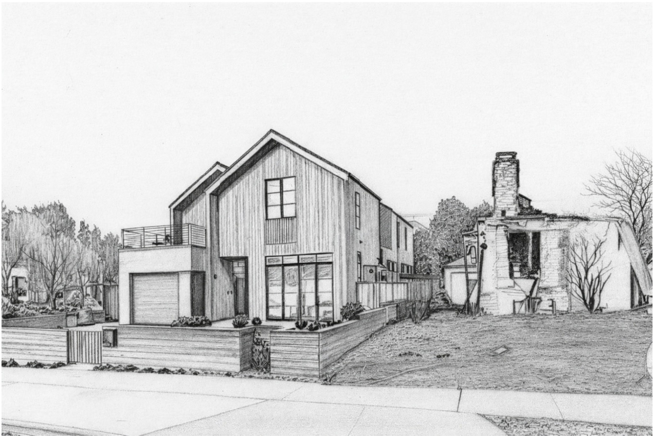
75 Figure 1. The sketch shows a wildfire-surviving house in Pacific Palisades, Los Angeles, constructed according to wildfire-resistant design principles. It is illustrating the concept of a non-combustible or fire-resistant exterior façade, helping to 80 reduce ignition from radiant heat and wind-driven embers. Multi-pane windows are used to increase resistance to heat exposure and minimize breakage. The design includes adapted roof overhangs, sealed eaves, and ember-resistant detailing that limit pathways for embers to enter the structure. Gutters are designed to reduce debris accumulation, further lowering fire risk. Further details for reducing vulnerability are described in Papathoma-Köhle et al. (2025). Together, these architectural strategies contributed to the building's remarkable performance during the 2025 wildfire events. Figure conceptualized from a Google Street View scene (02/2025).