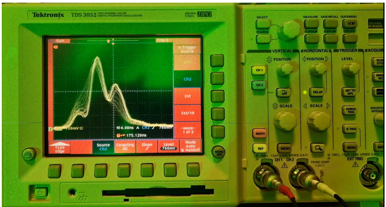
Fig. 3: Temporal courses of the laser pulse during the piezo scan near (top) and outside (bottom) a resonance condition.