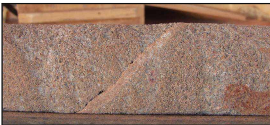
Cataclastic deformation bands with one open side from Tchirezrine II unit at Imouraren site.