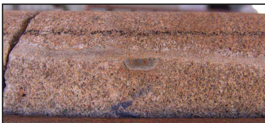
Cataclastic deformation bands crosscutting a clayey pebble from Tchirezrine II unit at Imouraren site.