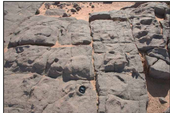
Photo of the Tchirezrine II outcrop showing orthogonal joint sets near the DASA site