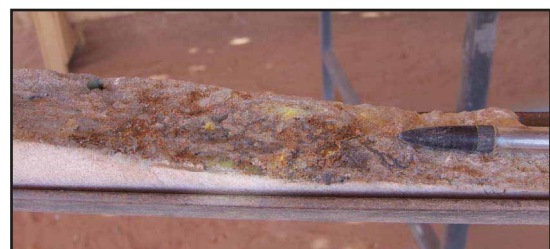
Open joint with some uraninite oxides from Tchirezrine II unit at Imouraren site.