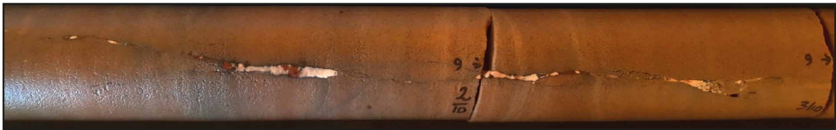
Mode I fracture with calcite seal in fine sandstone from Tchirezrine II unit at Imouraren site