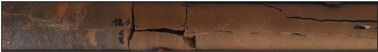
Structure vertical change as fonction of lithology, from cataclastic deformation band in very coarse sandstone to Mode I fracture in fine-medium sandstone from Tchirezrine II unit at Imouraren site