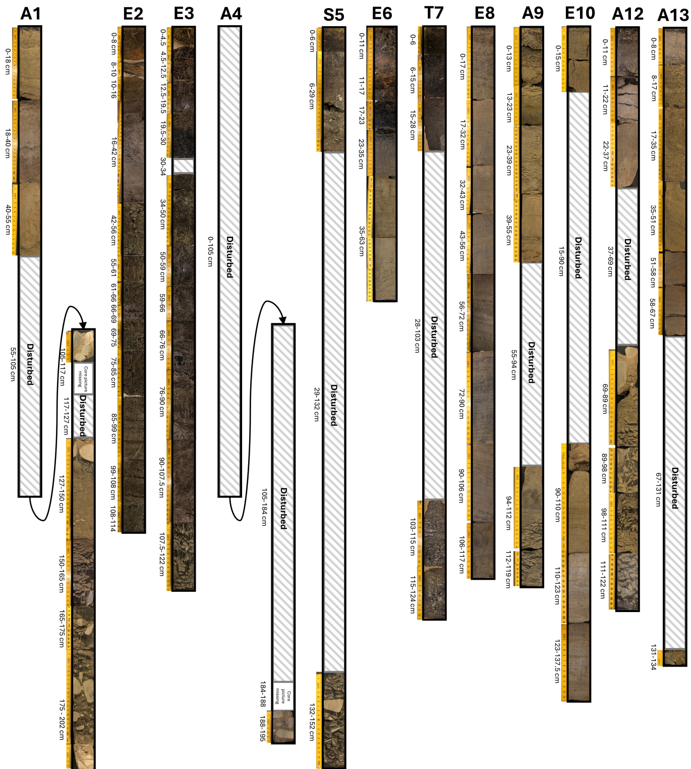
Figure S 10: Cross-sectional photos of all cores. The coring site name is shown on top, and depths (in cm) are increasing from top to bottom.