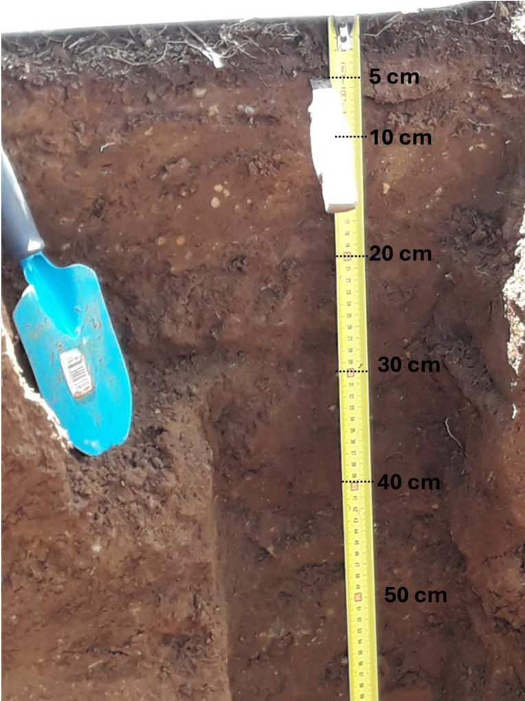
Figure 1. Picture of the forest soil profile during sampling.