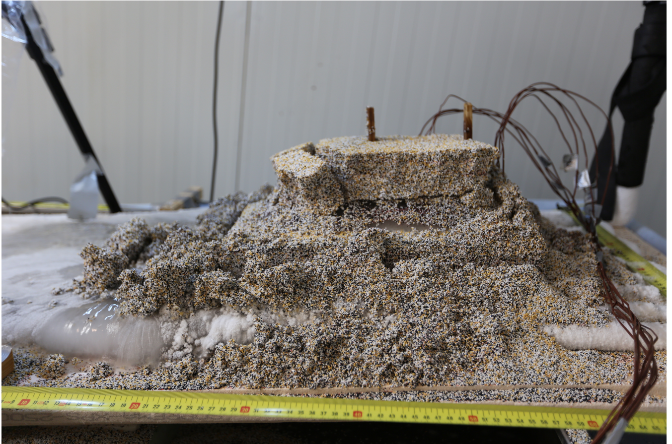
Fig.S 1. Side view of the PPP Ice-Layer case at 37 hours. The Block is 15 cm high and two slump blocks are detaching