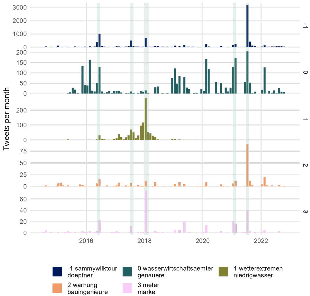
Figure S2. Occurrence of tweets related to the noise topic (top panel, excluded from further analysis) and development of monthly tweets for the four topics with the most occurring instances over the whole time period.