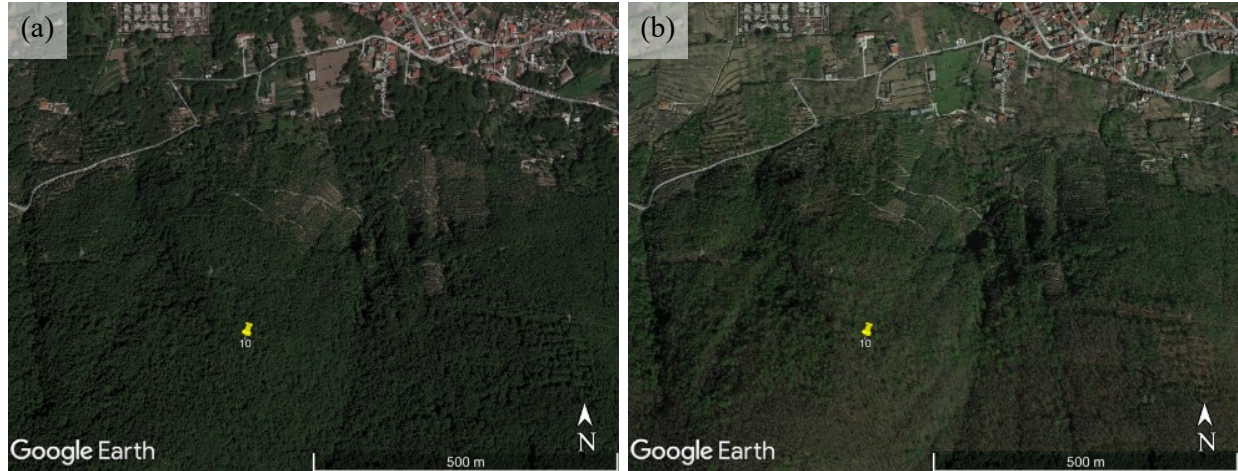
Figure R1-2. Satellite imagery taken in the area affected by landslide number 10 on (a) 6 August 2019 and (b) 9 April 2021.

While the occurrence of landslide 9 is well documented (see Figure R1-1) at the reported location and date, the occurrence of landslide 10 cannot be undoubtedly confirmed at the reported location and date (see Figure R1-2). If event number 10 is excluded from the threshold performance analysis, the TSS increases to approximately 0.4 and 0.6 for the meteorological and hydrometeorological thresholds, respectively.