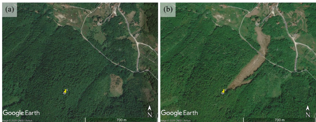
Figure R1-1. Satellite imagery taken in the area affected by landslide number 9 on (a) 6 August 2019 and (b) 9 May 2020.

Finally, event number 10, reported on February 15, 2020, was linked to a small rainfall event of 15 mm at Cervinara (8.6 mm and 25.3 mm at Rotondi and S.M. Valle Caudina stations) with an intensity of 2.1 mm/h. The antecedent soil water content was recorded at around 0.32 by ERA5. However, there is no documentary evidence of any morphological changes on the slopes where the landslide was reported or any hydrological emergencies around the time of the event. Figures R1-1 and R1-2 present historical satellite imagery taken on two different dates, before and after the reported occurrence of landslides 9 and 10.