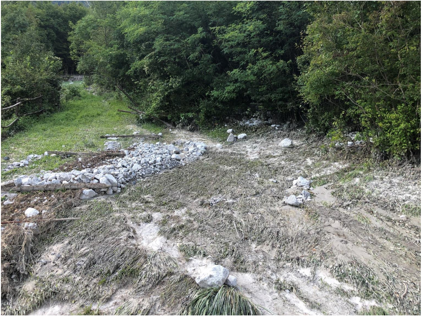
Figure 5. Photo D.