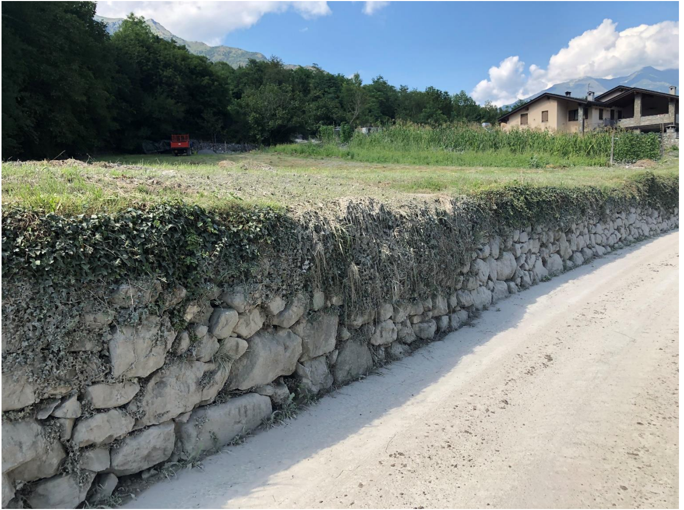
Figure 6. Photo E.