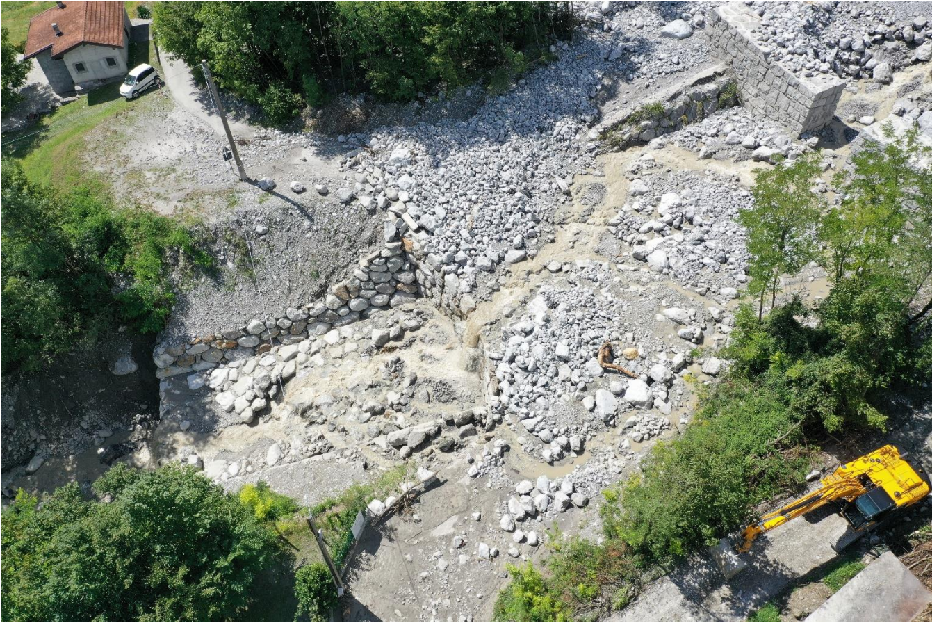
15 Figure 4. Photo C.