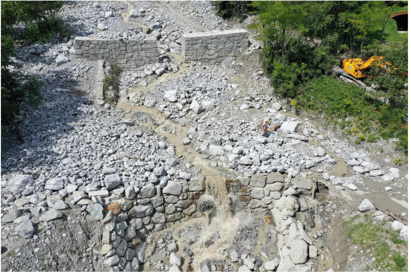
Figure 3. Photo B.