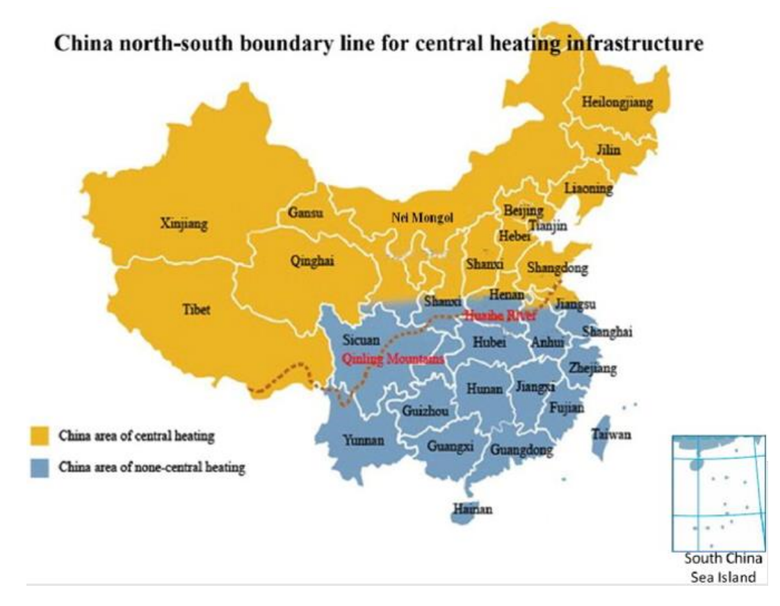
Figure R1. The central heating north—south boundary in China.

Response: Thank you for your helpful suggestions. The areas with central heating typically experience an average annual temperature below 15°C, while areas without central heating generally have higher average annual temperatures, often exceeding 15°C. Notably, the differentiation between areas with and without central heating in our study closely aligns with the well-recognized Qinling Mountains-Huaihe River line, which serves as the north-south boundary in China (Figure R1). We have incorporated additional details and descriptions for Figure 1 to provide further clarity.