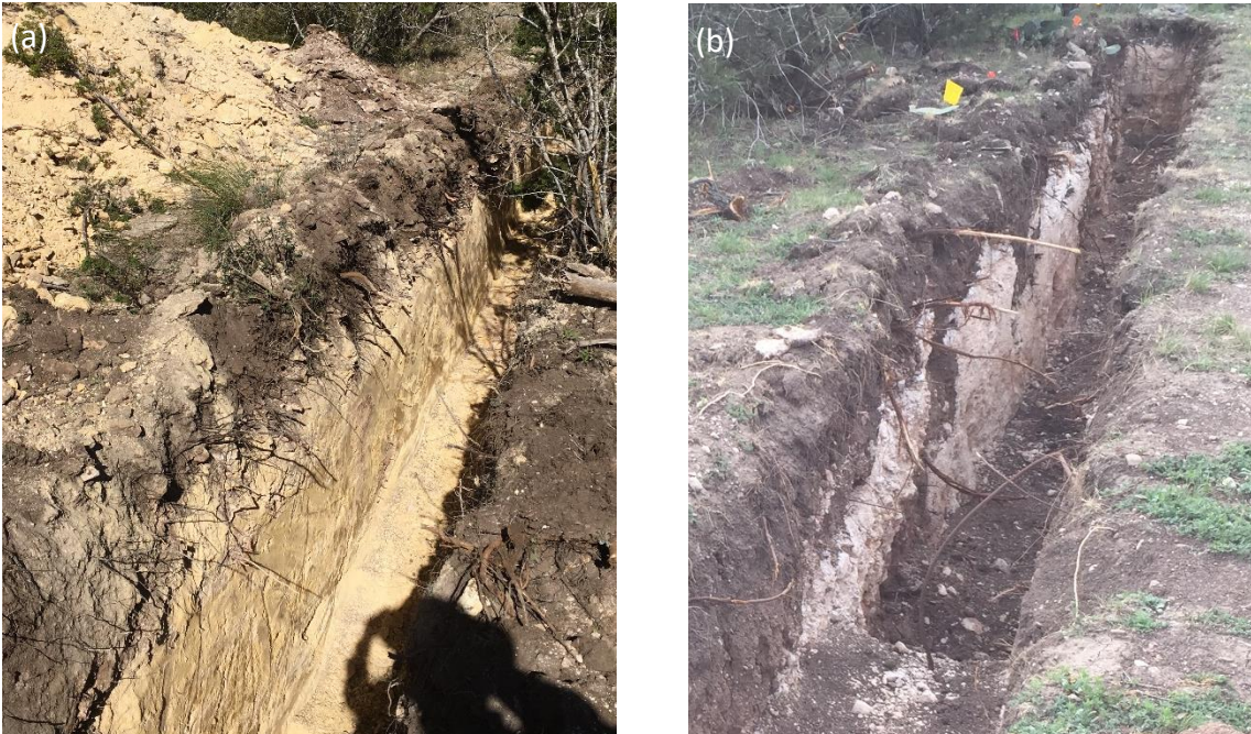
Figure X. Trench 5A (a) and Trench 6 (b) in Buda soil at Texas A&M AgriLife Sonora Research Station on the Edwards Plateau, Texas.

We also propose adding Figure X below to the supplemental materials.