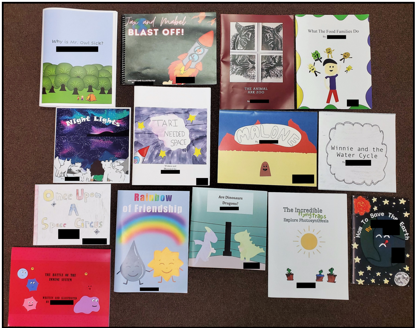
Figure 3. Photograph of children's books created by students.

Students used Microsoft and Adobe products to write, illustrate, and lay out the pages of their books. Illustration media or mixed-medium options were selected by each illustrator and supplies were purchased using the total course budget of $1875. The college print shop provided all printing services for the book products, but students were also encouraged to pursue other available self-publishing options after the end of the course.