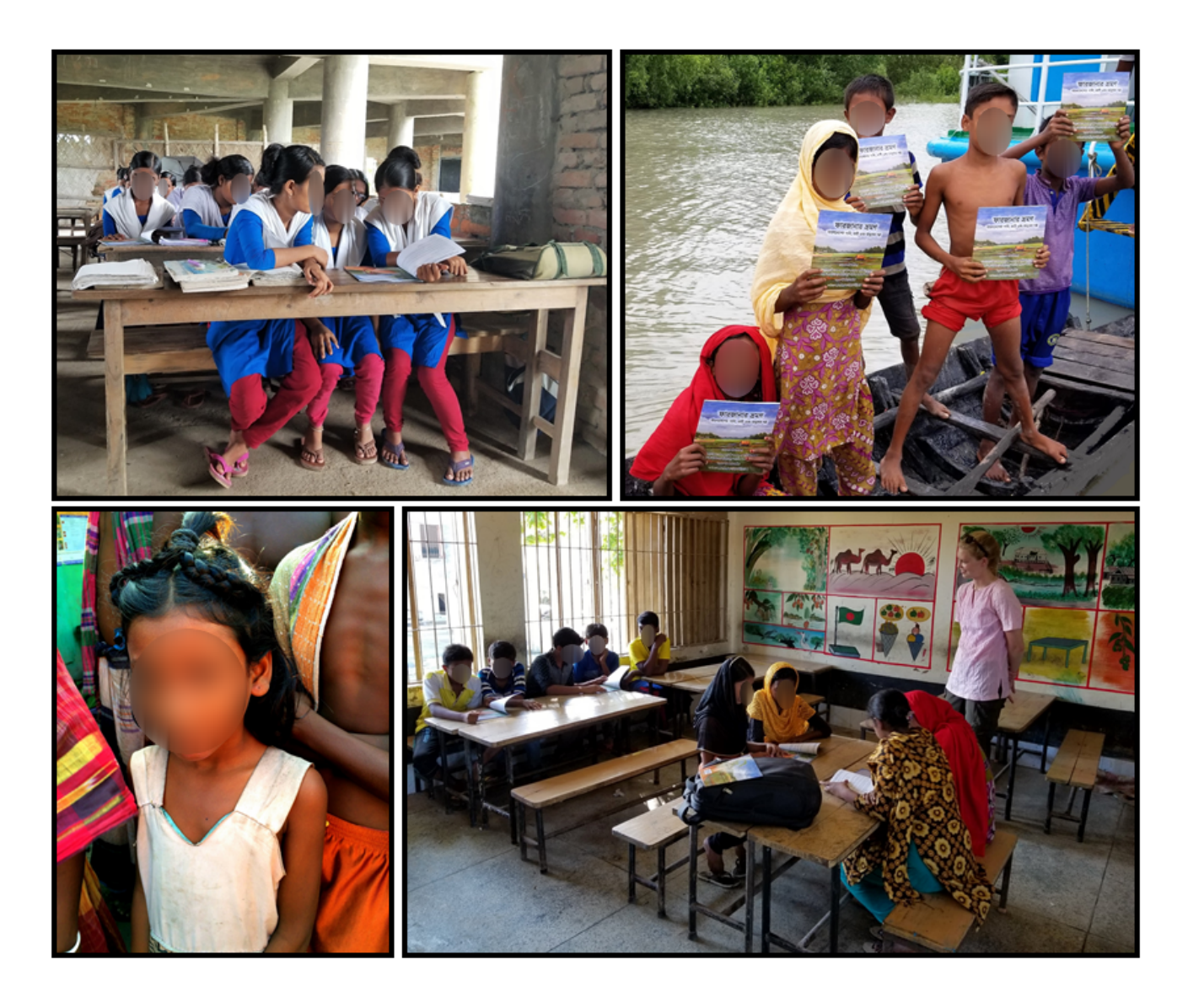
Figure 2. Photographs taken during the distribution of the book.