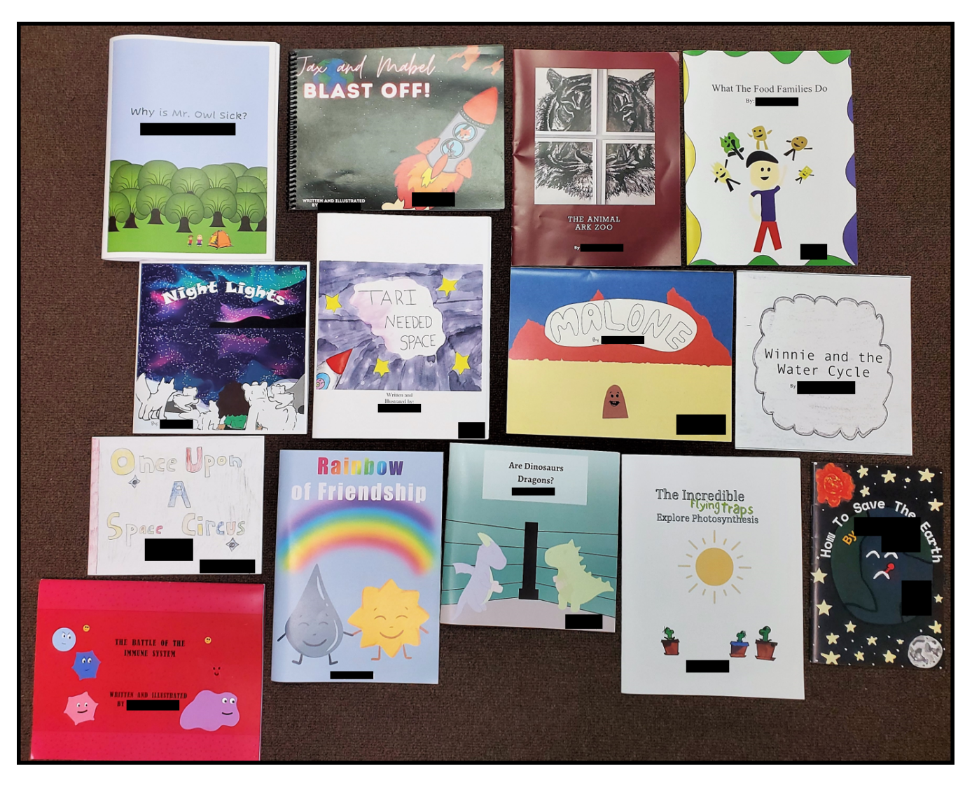
Figure 3. Photograph of children's books created by students.

Students used Microsoft and Adobe products to write, illustrate, and lay out the pages of their books. Illustration media or mixed-medium options were selected by each illustrator and supplies were purchased using the total course budget of $1875. The college print shop provided all printing services for the book products, but students were also encouraged to pursue other available self-publishing options after the end of the course.