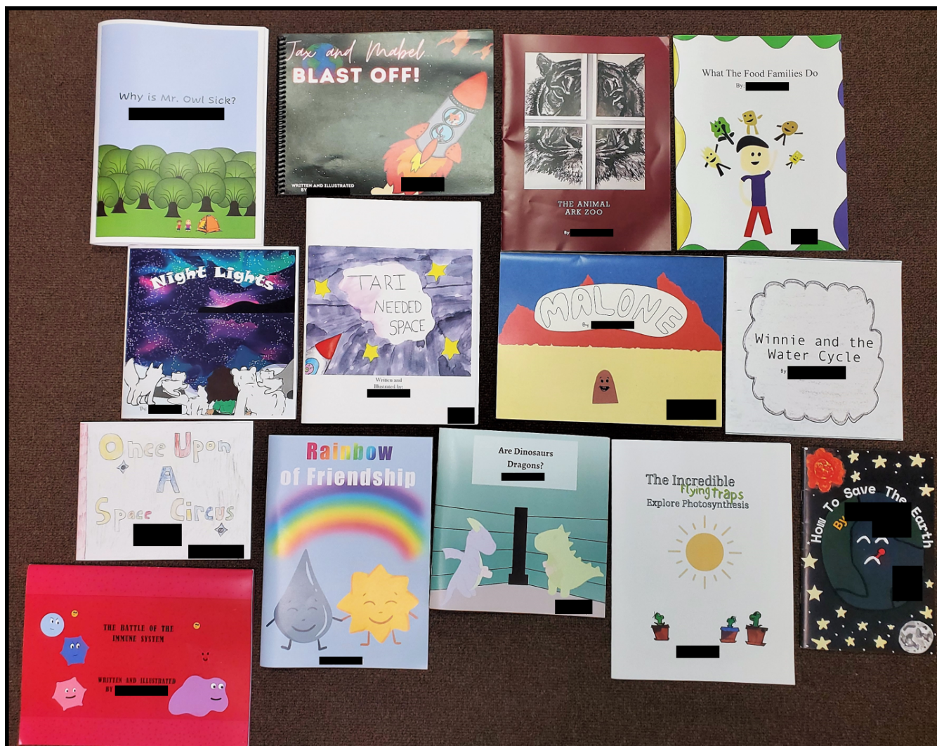
Figure 3. Photograph of children's books created by students.

At the start of the course, students were told that the course would not follow their typical academic experience. While students were still required to do research, present arguments, and think carefully about how an audience will respond, their synthesis of content would not culminate in a standard academic paper for the professor. Instead, the students would gain first-hand experience communicating inside and outside the classroom with the creation of their very own children's book. The course was composed of five distinct components: (1) daily attendance and participation in course discussion, (2) the completion and submission of an idea, (3) the drafting, creating, printing, submitting, and exhibiting of a self-published book, (4) collaboration with peers and stakeholders, and (5) reflection on the IL experience.