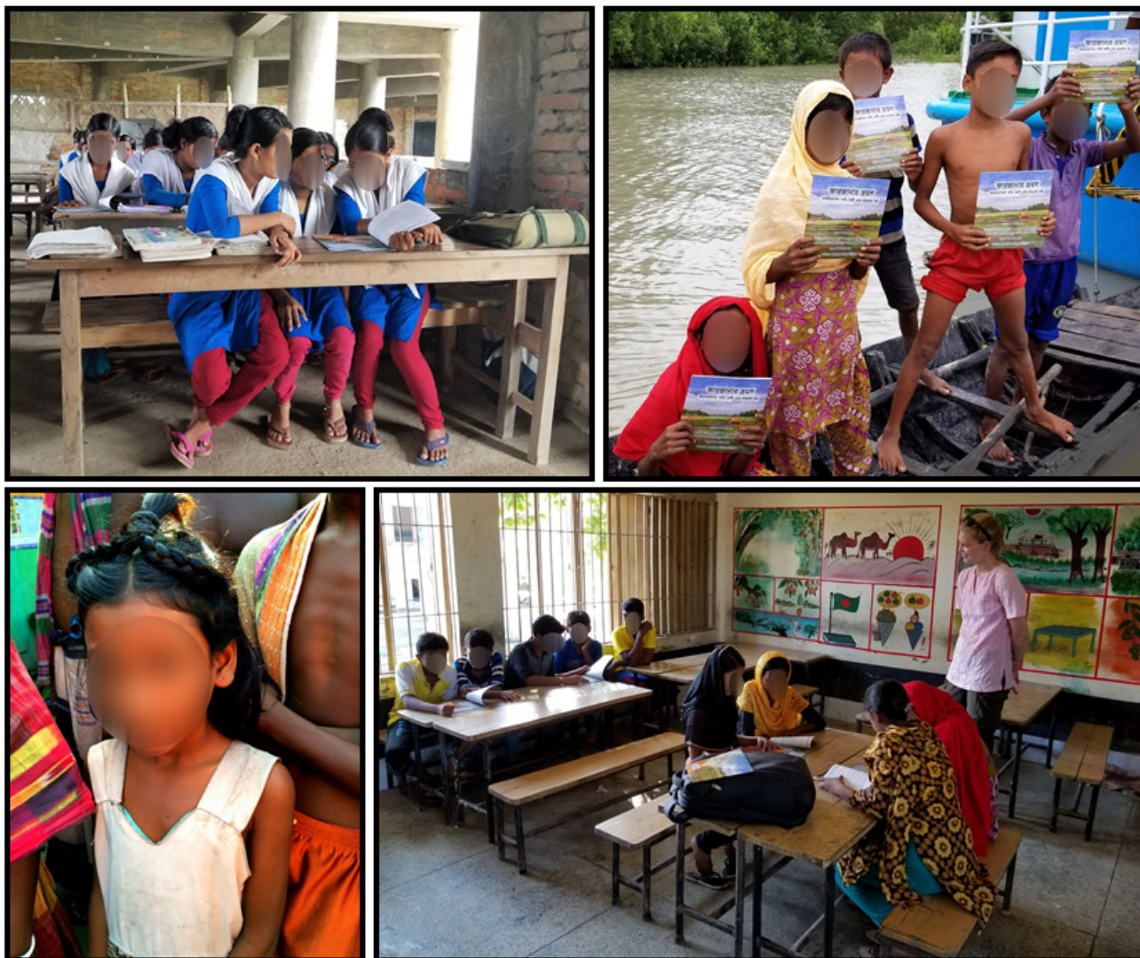
Figure 2. Photographs taken during the distribution of the book.

170 presented in their own children's book, and (3) developed communication literacy to draft, publish, and exhibit a children's book that explores a key concept in science. In the subsequent sections, I discuss the curricular context and layout of the course, the assessment of deliverables, and the impacts of the science storytelling process. I hope similar intensive learning models could be constructed to benefit science communication efforts among students, early career scientists, and local communities.