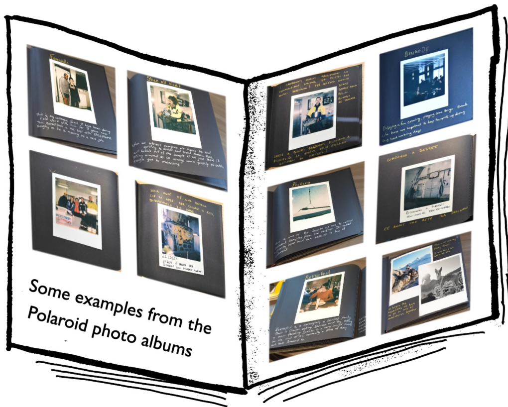
Figure 3: Some examples from the scientists' polaroid photo albums that they made for the classes they interacted with. The photos are simply meant to give an idea about how the albums were constructed. The captions are not meant to be readable in the present setting.