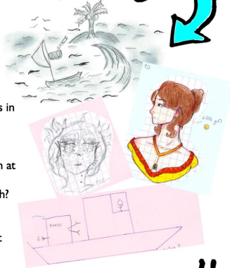
420 Figure 2: Examples of some of the questions the students wrote to the scientists after their teachers had gone through what a research process looks like and introduced them to their scientist. Here are also some of the pictures the students included in in their hand-written questions.