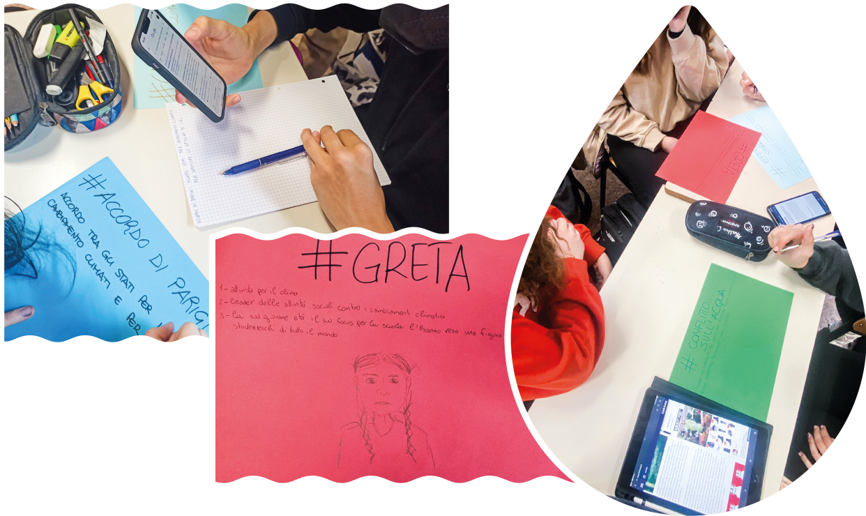
Figure 3. Some content from Module 2 of Water and Us: students proposing definitions of the most recurring terms related to climate change.

why definitions may differ across them. After this first round, each group of students is asked to explain their definition to the class to not only improve shared knowledge, but also potentially compare definitions across groups and so realize the quality of accredited and independent sources.