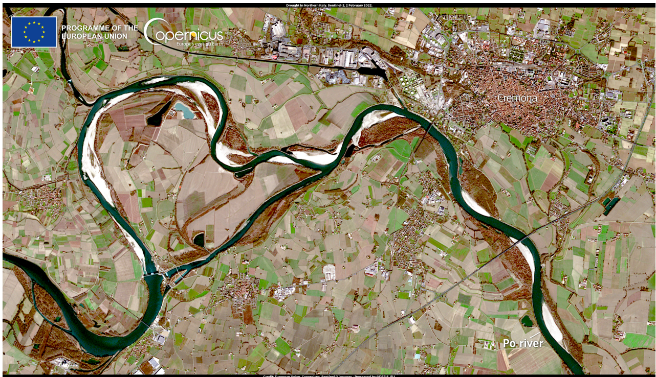
Figure A1. Two key features of the 2022 Italian drought, a marked deficit in snow cover (upper panel, Place Moulin in Aosta valley, June 2021 vs. 2022) and low streamflow (lower panel, Po river at Cremona).