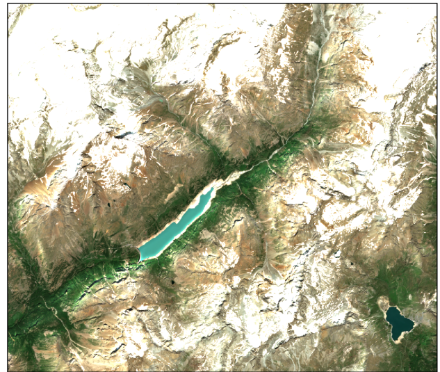
Place Moulin, June 2021 (left) vs. June 2022 (right)