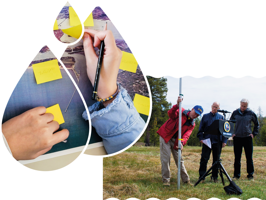
Figure 2. Some content from Module 1 of Water and Us: students learning how to read the waterscape (who is using water, where, and why?) and an iconic image of the California snow drought (then Governor Jerry Brown taking part in the 2015 Snow Survey at Phillips Station, the first with no snow on the ground in April– credits: CA Department of Water Resources).

135 which is often overlooked and rarely seen as a key precondition for life on our planet (Barnett et al., 2005). Third, that this natural/anthropogenic water cycle is changing, due to a recurring pattern in temperate regions of warmer temperatures, less snow, and eventually less available water (IPCC, 2022).