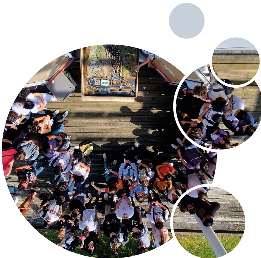
Figure 7. High-school students visiting CIMA Research Foundation to learn about floods during one of our Water and Us initiatives. This was an opportunity to discuss about employability in climate-change science as part of a “Paths towards Cross-cutting Skills and Orientation” (PCTO, see main text for details).

time provided us with the opportunity to explicitly discuss with students about job opportunities related to climate change and science (Figure 7).